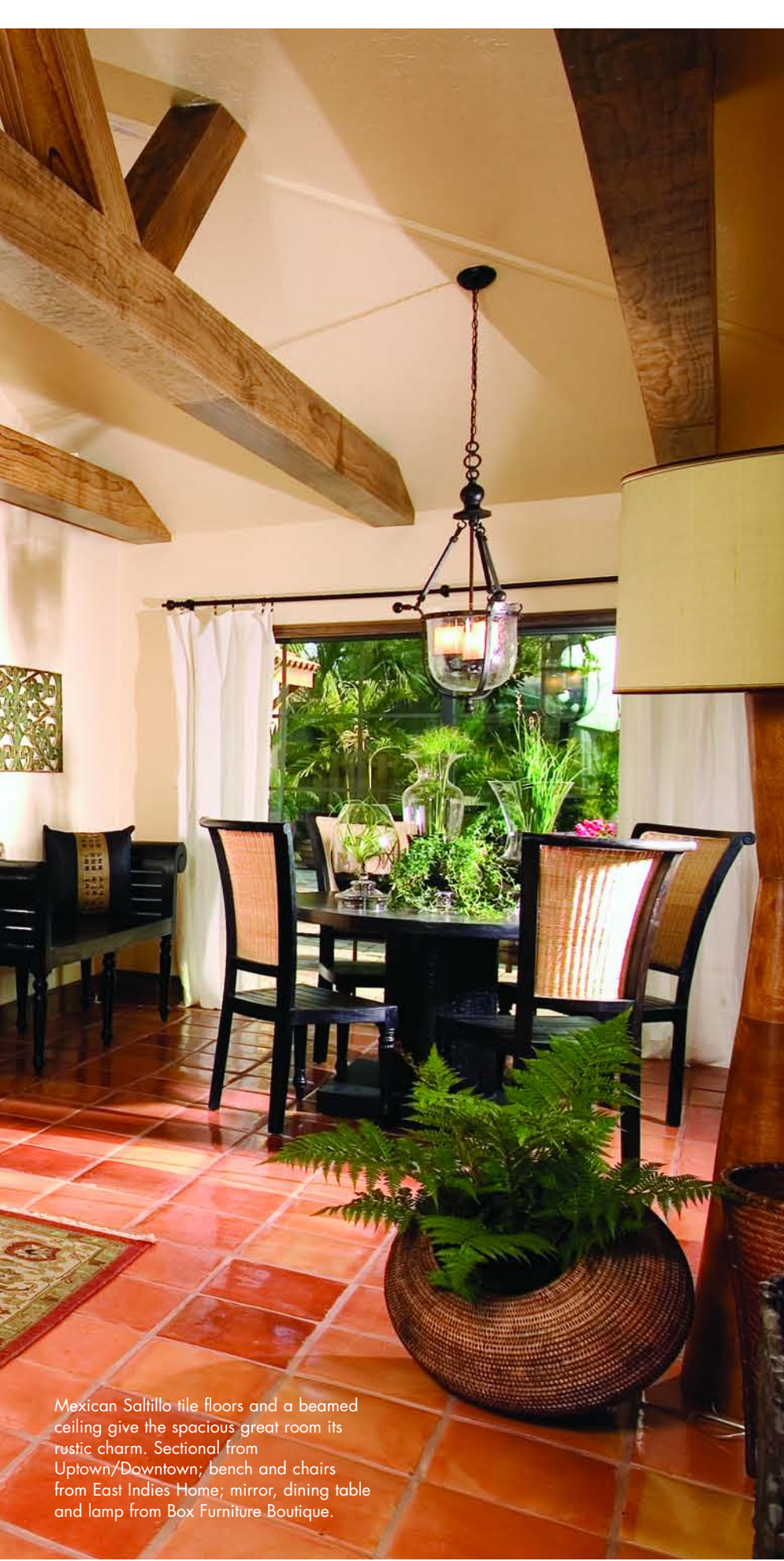
Mexican Saltillo tile floors and a beamed ceiling give the spacious great room its rustic charm. Sectional from Uptown/Downtown; bench and chairs from East Indies Home; mirror, dining table and lamp from Box Furniture Boutique.

STORY BY CANDICE MUTSCHLER STYLING BY ANA TODD